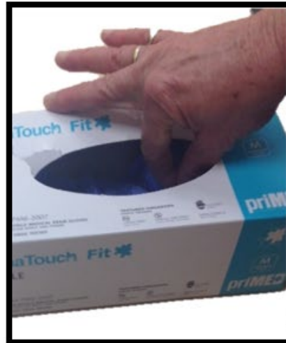
Take a glove out of its original box.