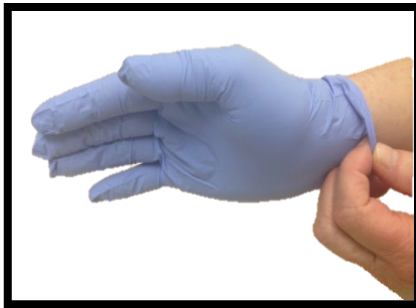
Don the first glove.