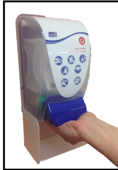
Perform hand hygiene after glove removal.