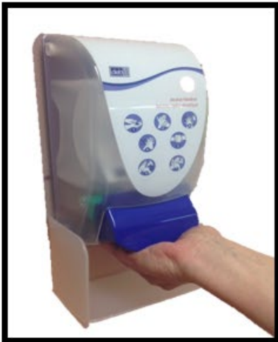
Perform hand hygiene.