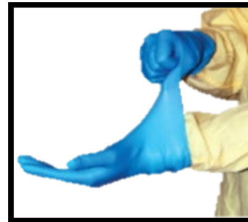
Gloves go over the cuff of the gown.