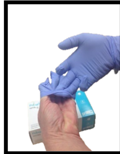
Take the 2 nd glove with the bare hand and touch only the top edge of the cuff.