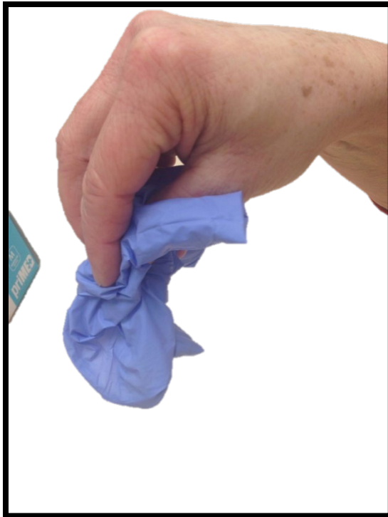
Discard the gloves.