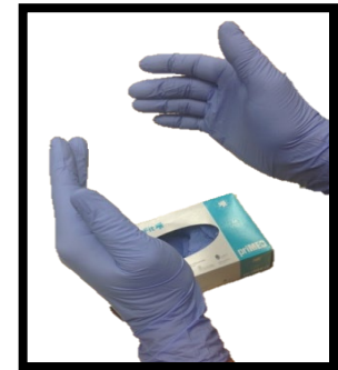
Avoid touching the skin of the forearm with the gloved hand. Once gloved, hands should not touch anything other than the direct task for glove use.