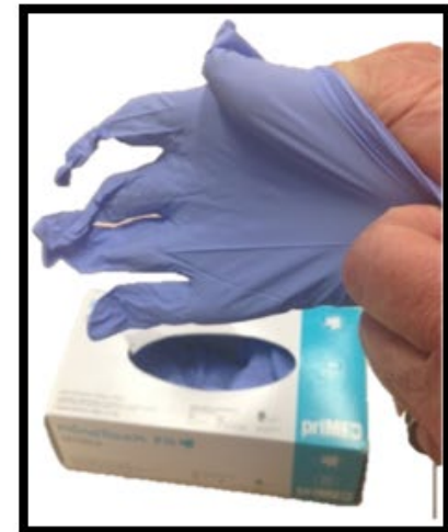
Touch only the top edge of the cuff.