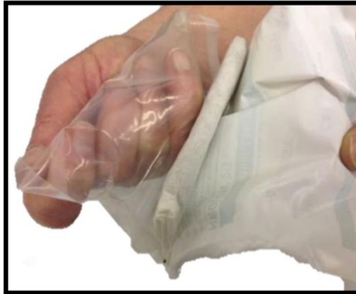
Open the inner glove packaging to expose 2 nd sterile wrapper.