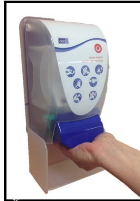
Perform hand hygiene after glove removal.