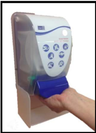
Perform hand hygiene.