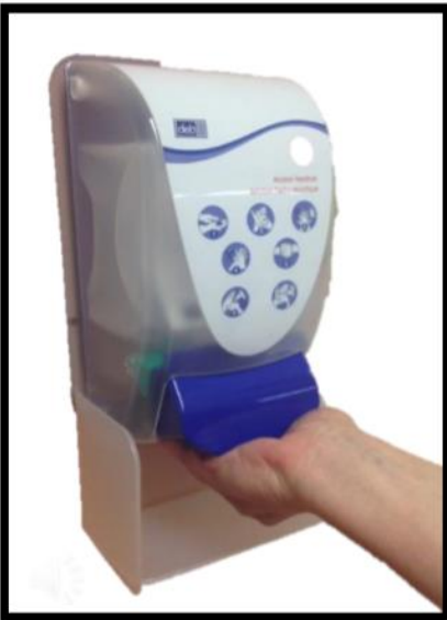
Perform hand hygiene.