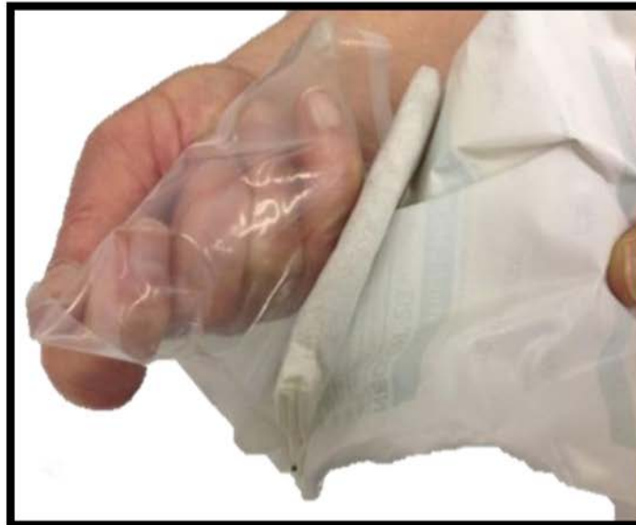
Open the inner glove packaging to expose 2 nd sterile wrapper.