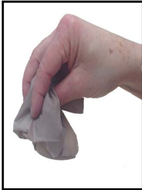
Discard the gloves.