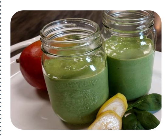
Banana Mango Smoothie Program: Preparing for Bariatric Surgery Cooking Class