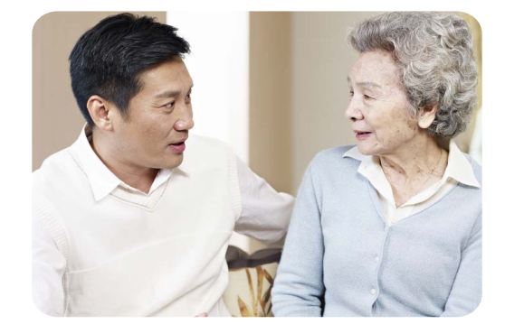
Support and information for people that are grieving a loss.