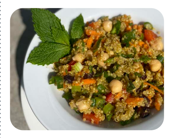
Moroccan Quinoa Salad Program: Cooking When Fatigued

Registration: https://redcap.link/CookingWhenFatigued