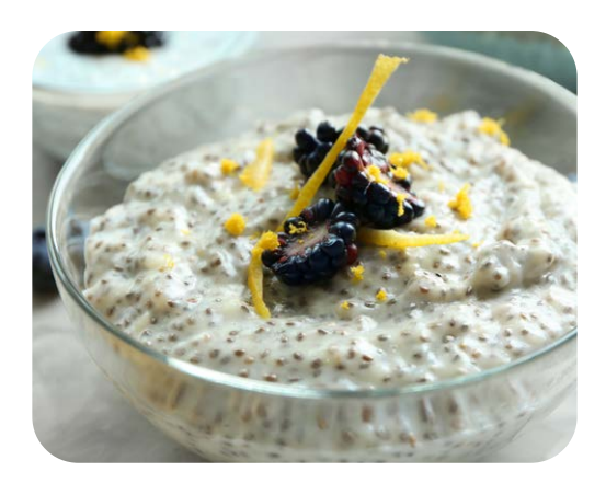
Lemon Chia Pudding Program: Cancer Recovery: Cooking for Taste & Swallowing Difficulties

Registration: https://redcap.link/CancerRecoveryCooking