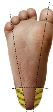
Poke the heel in the yellow shaded areas, as shown here