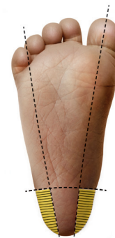
Poke the heel in the yellow shaded areas, as shown here