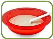
Baby cereal with iron