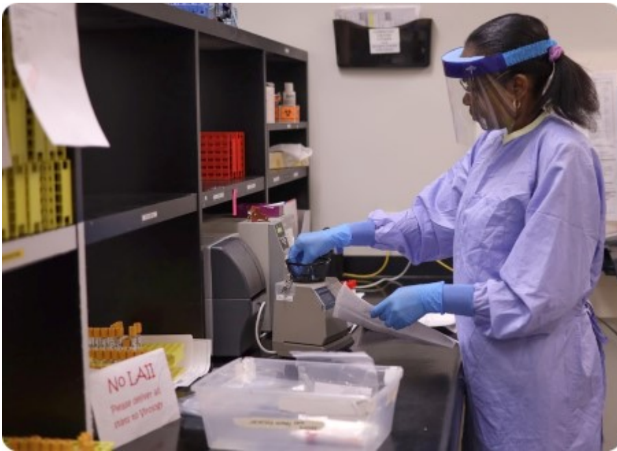
The Alberta Precision Labs team processed thousands of COVID-19 tests in 2020.