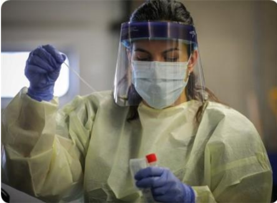
When news of the pandemic grew, AHS staff were quick to mobilize, offering COVID-19 testing to Albertans across the province.