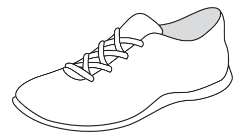
Running shoes are supportive. Choose a pair with a thin sole so you can feel the surfaces you walk on.