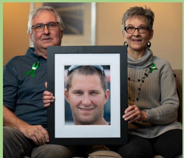
- Polanski Family

Make things better, not just for ourselves, but for everyone around us!