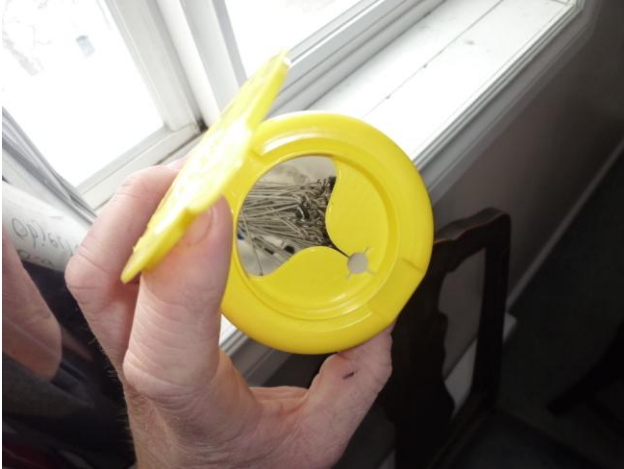
Appendix Photo C: Contaminated tattoo needles were not being disposed of in a puncture resistant container with a tight fitting lid creating a potential for accidental needle stick exposure.