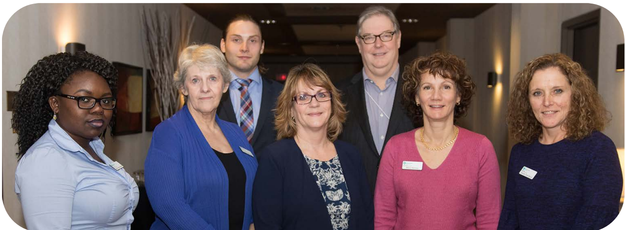
Wood Buffalo council members gather at Annual Fall Forum in Edmonton