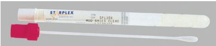
Current Amies (magenta top) to be replaced